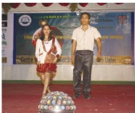
Fashion Show at Autumn Aura