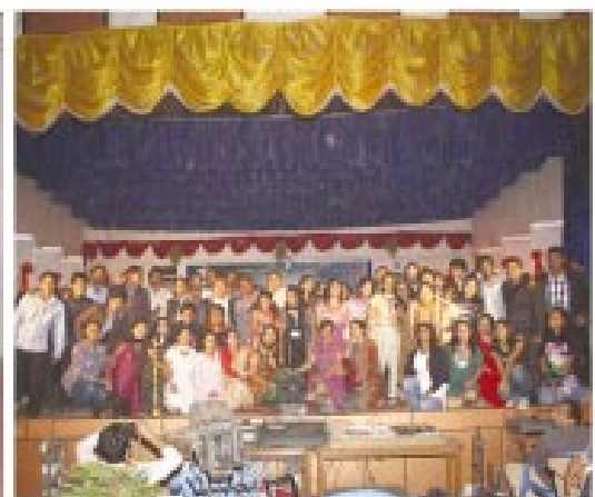
Students who made sanMilan 2010 a reality

Drop in your comments, criticisms and suggestions on this issue at newsletter@cmsdu.org Inspire us to work more on this newsletter. Help us make it a happening newsletter!