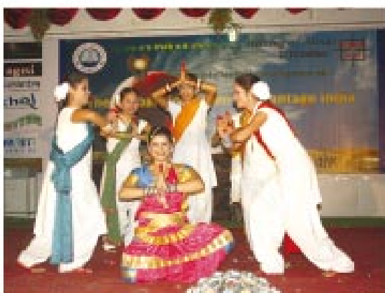
Prayer Dance at Autumn Aura