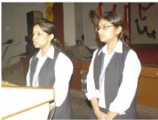
Presenters at Agni