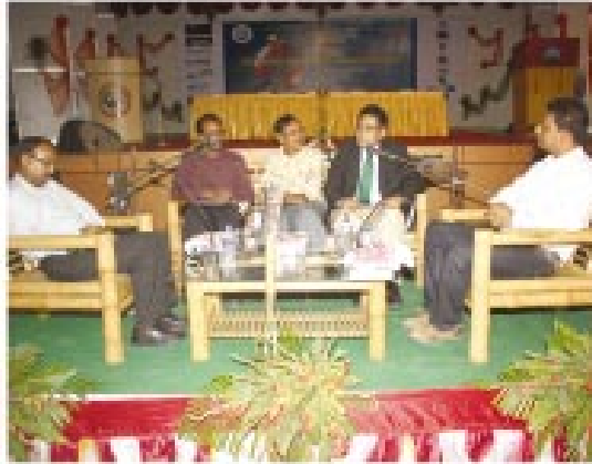
Panelists at Manthan