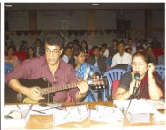
Judges at Rhythm