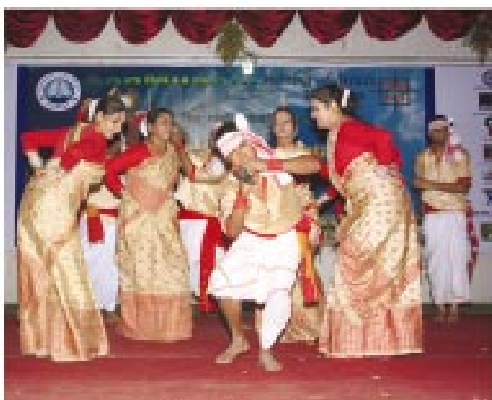
Bihu at Autumn Aura