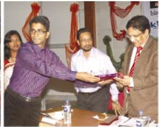
Release of The Souvenir