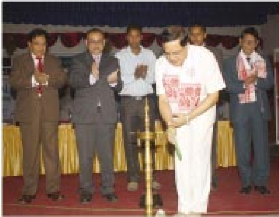
Lighting of the Ceremonial Lamp