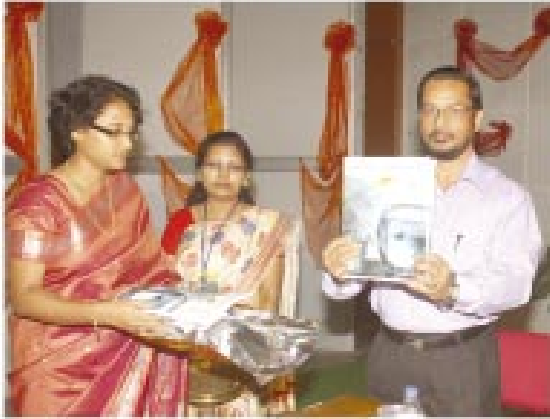
Release of The Placement Brochure