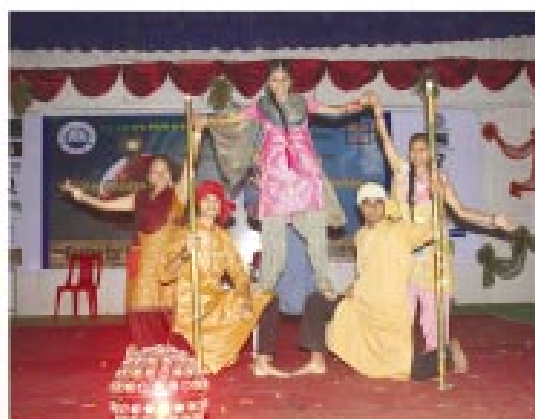
Bhangra Dance at Autumn Aura