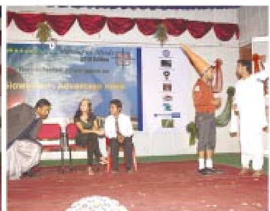
Drama at Autumn Aura