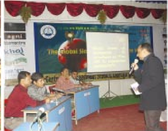
Quizzards at Bizmantra